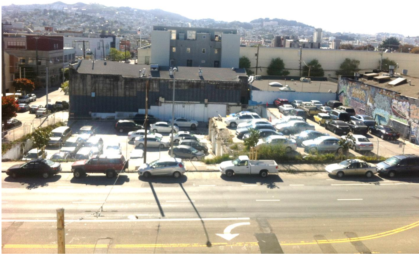
Currently occupied lot at 480 Potrero