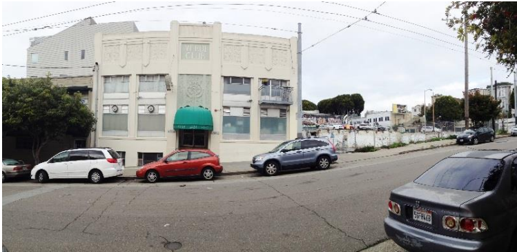
Verdi Club 2424 Mariposa Street

The Verdi Club is an Italian American social club that was established in 1916 and moved to its present location at 2424 Mariposa Street in 1935. For nearly a century, its members have been dancing, dining, and socializing in this storied hall. Verdi Club is home to Rock Band Land, a music school for children 4-8 which operated M-F after school and on Saturdays.