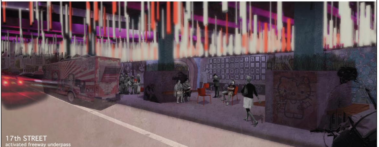
17th STREET activated freeway underpass

Cutting into the slope to provide more usable space under the freeway creates a space for art, technology and food