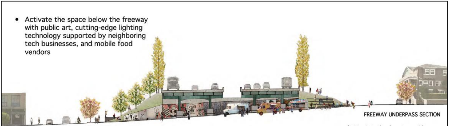
FREEWAY UNDERPASS SECTION

Cutting into the slope to provide more usable space under the freeway creates a space for art, technology and food