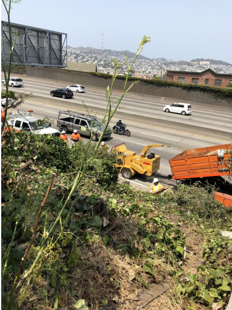
Caltrans Maintenance cleans up what they can.