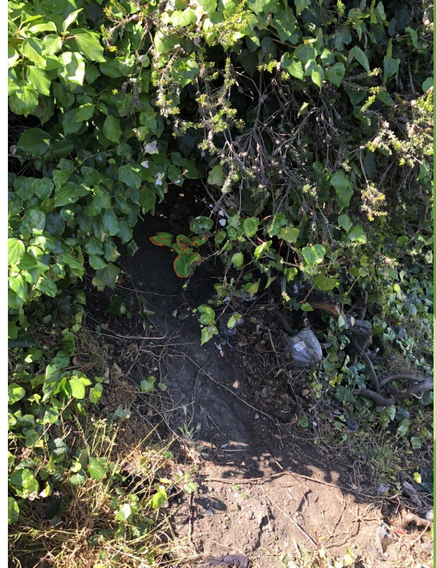
Overgrown growth - Areas to hide