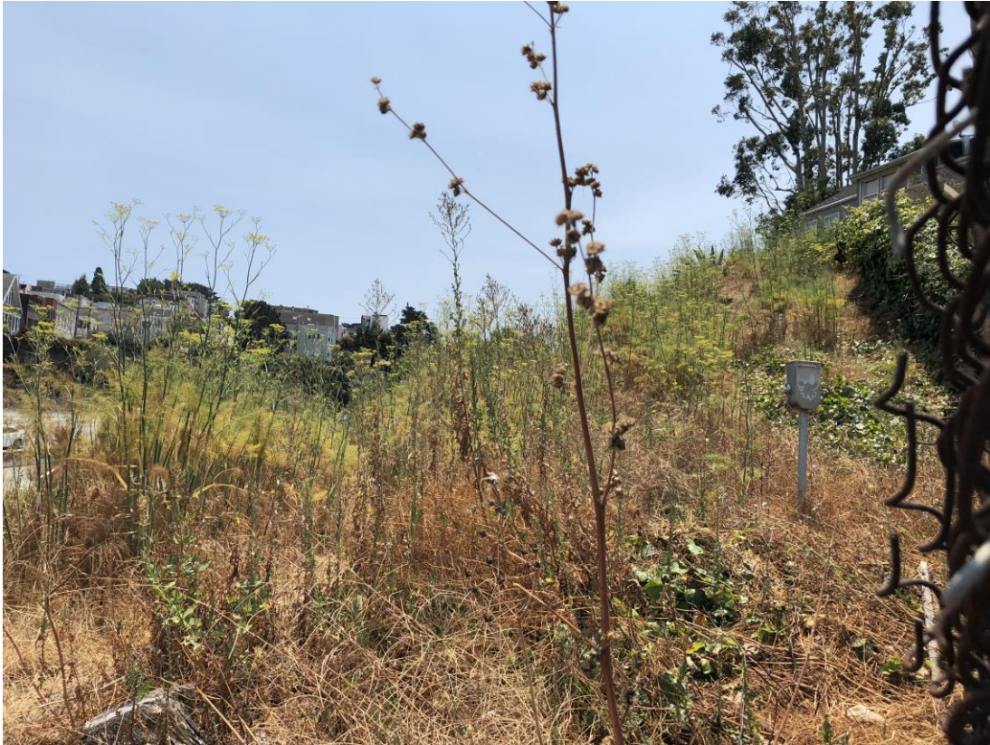
Weeds, Weeds, Weeds.....