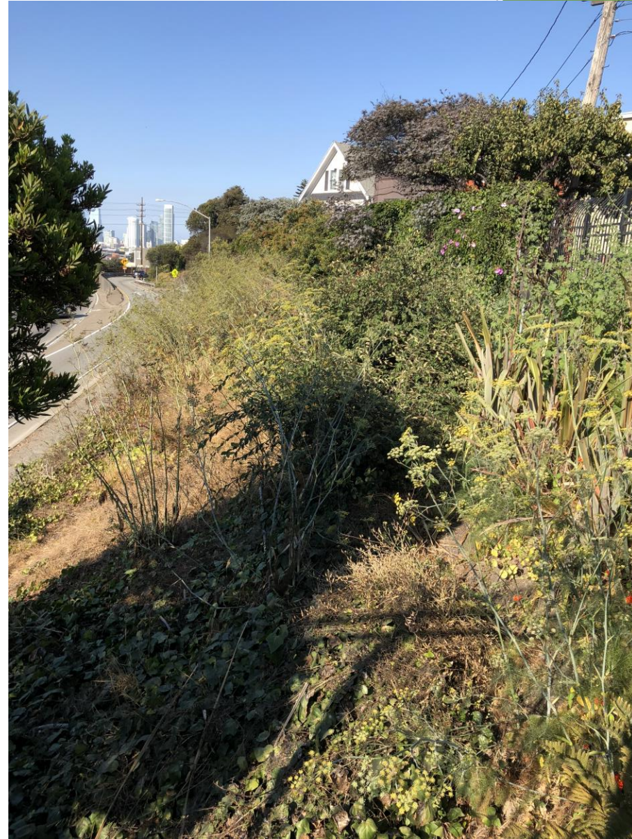
Green that turns brown